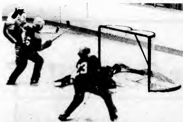
Humber Hawks — score during tournament in Kingston.