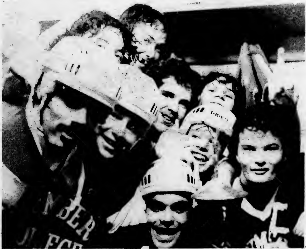
Sweet victory —The Humber Hawks celebrate after winning the Royal Military College Invitational Tournament in Kingston last weekend. The boys whipped Canadore 11-3 and Centennial 6-4. See story pg. 7.

For the final part of the evaluation, the inspector and the worker representative will talk about resolving any safety problems they may have found.