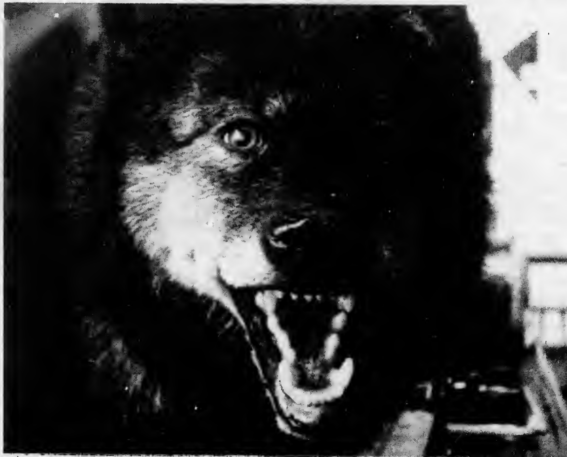
Over 4 million animals such as this were killed in Canada last year.

Investigators requested names and addresses of program graduates, so they could determine whether or not there had been infractions or abuse occurring.