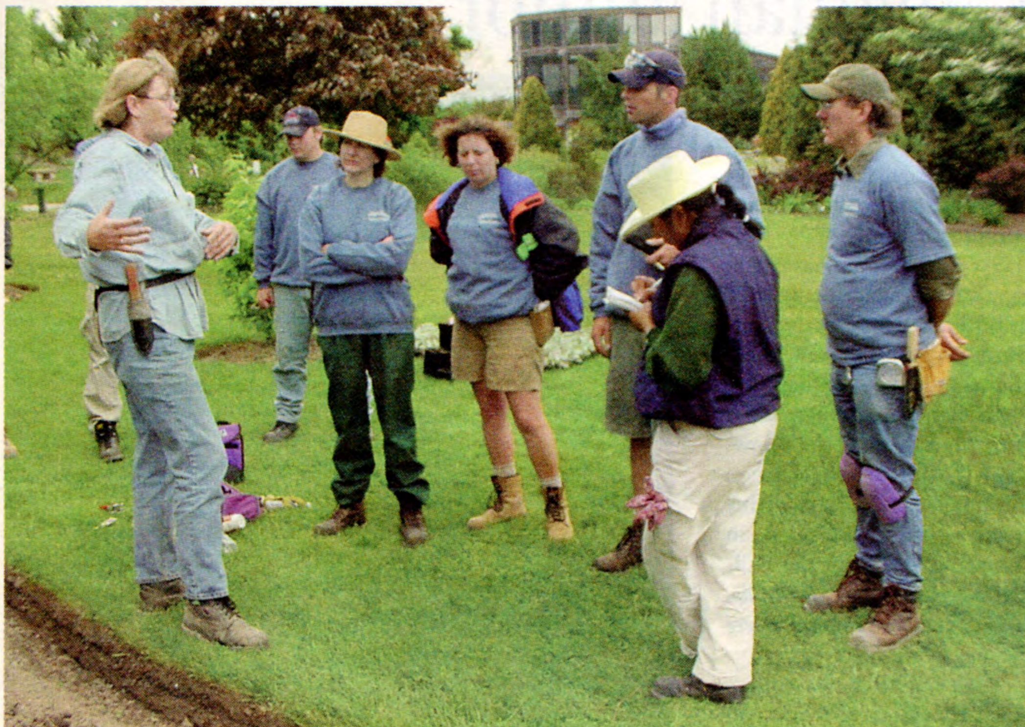
Students perform study at the Nature Centre.

The current Nature Centre at the Arboretum is undergoing a retrofit to create a new Centre for Urban Ecology. Once completed, the Centre will have a capacity for over 45,000 visitors annually. It will be a place for research, education and innovation and it is to be a model for environmental sustainability. The expansion is to