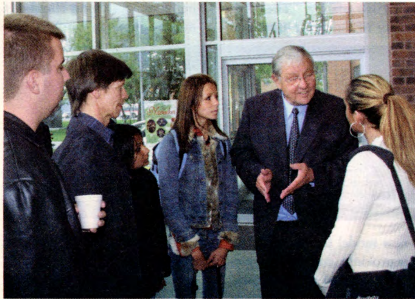
Chief Justice R. Roy McMurtry chats with students of Humber's Paralegal Studies degree program.

Humber's degree program in paralegal studies is unique in Ontario, focusing on the fundamentals of paralegal practice within an overall liberal arts