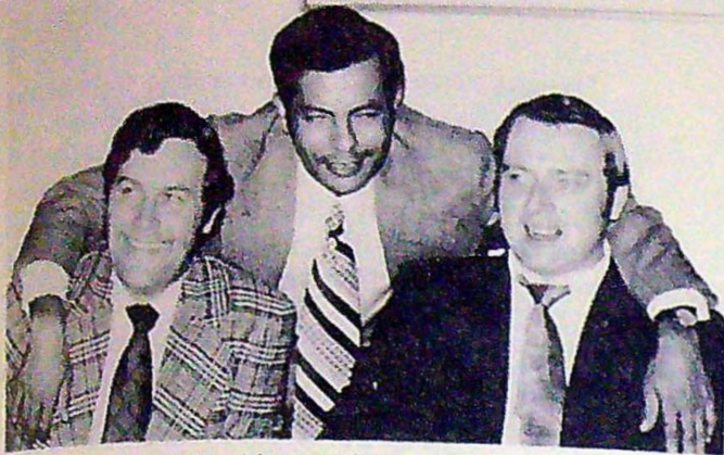
Some of the Humber bus drivers at dinner.