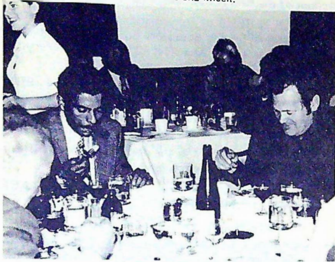
Dinner guests at Awards Night.

A maximum of 25 children will be accepted. The cost for each child is $50.00 for the Summer.