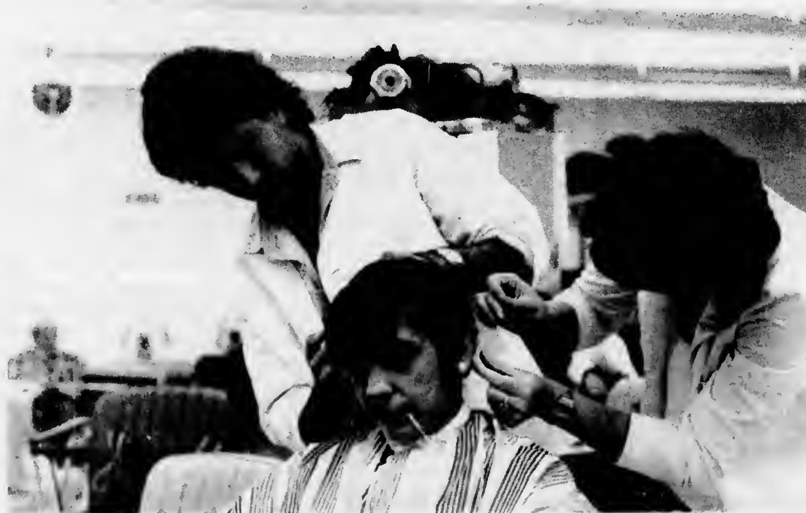
Hairstyling students work their magic on a Coven reporter.

The woman was then rushed to Etobicoke General Hospital where, thanks to the quick action of Humber's hairdressing students, she recovered with hair intact.