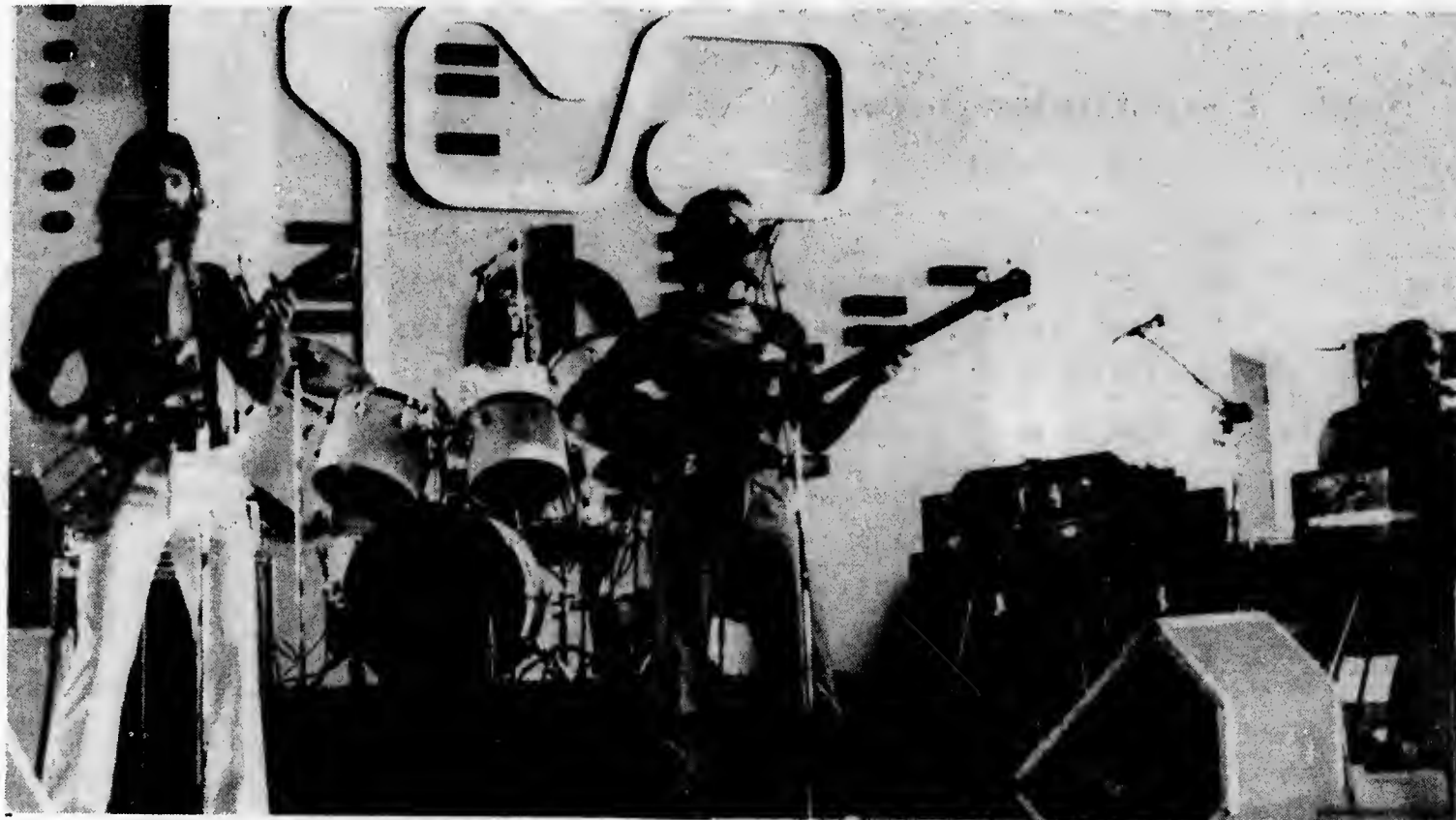
Toronto rock group Glider played to an enthusiastic audience on Thursday, both in the free concert in the con-

course and later on that evening in Caps.