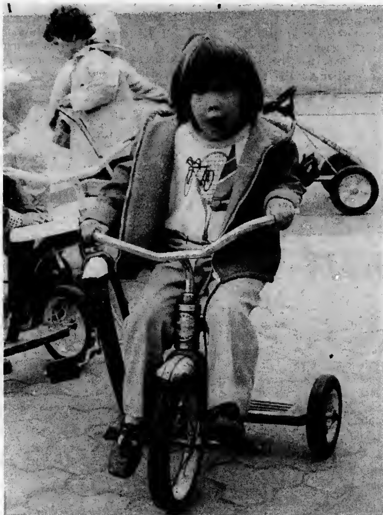
Beating the energy crunch, Humber Daycare kids get around on pedal-power. See story on page 10.

Humber College of Applied Arts & Technology