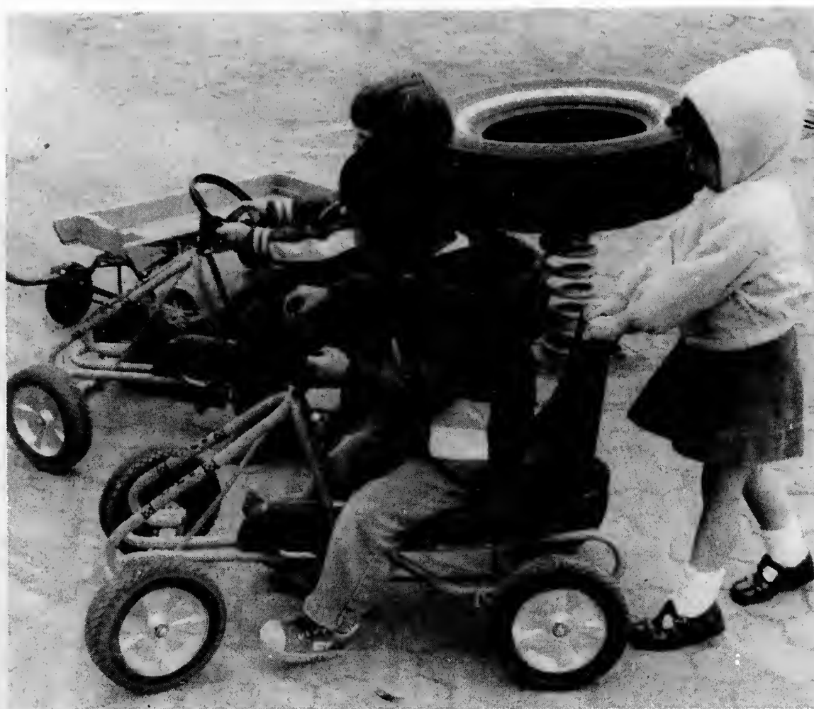
Women's lib at its finest. Just kidding folks—Humber's daycare children believe in equality, at least, equal fun that is.